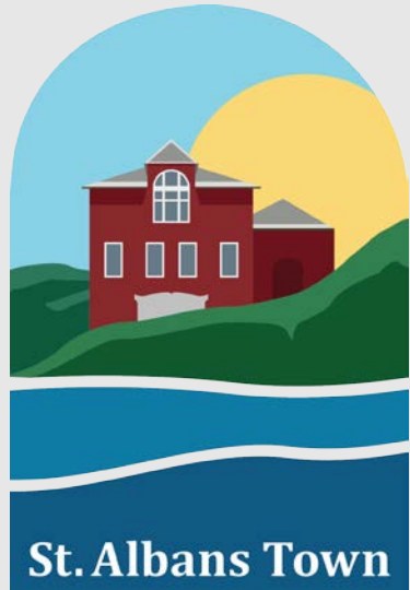
TOWN OF ST. ALBANS