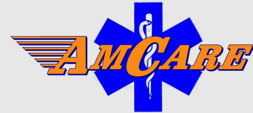
FIRST RESPONDERS: POLICE, FIRE, AND EMERGENCY MEDICAL