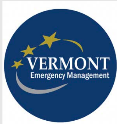
STATE OF VT HEALTH AND EMERGENCY OPERATIONS DEPARTMENTS